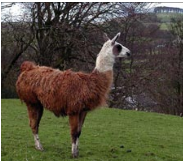
K-Man's Wicked Animals #4